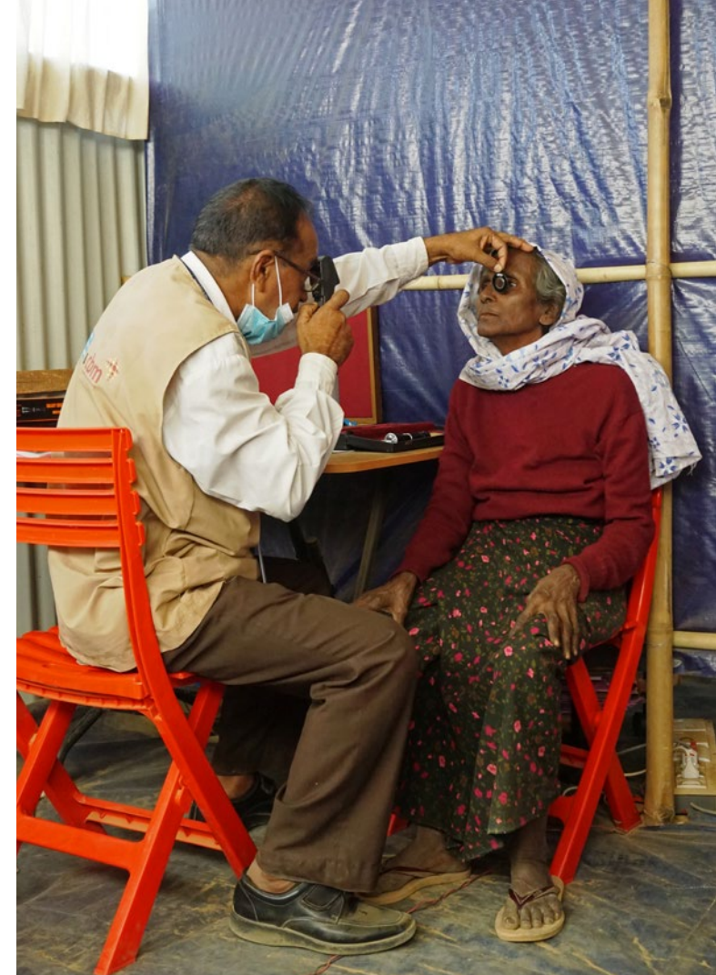
Cox's Bazar, Bangladesh. An elderly Rohingya woman receives an eye health assessment for the first time in her life at a cbm health camp in Cox Bazar.